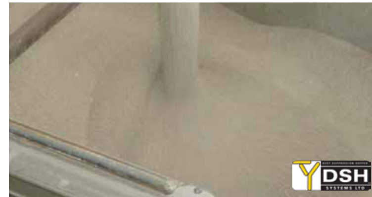
With DSH systems, there is no dust generation on impact. Radial flow occurs away from the impact point.