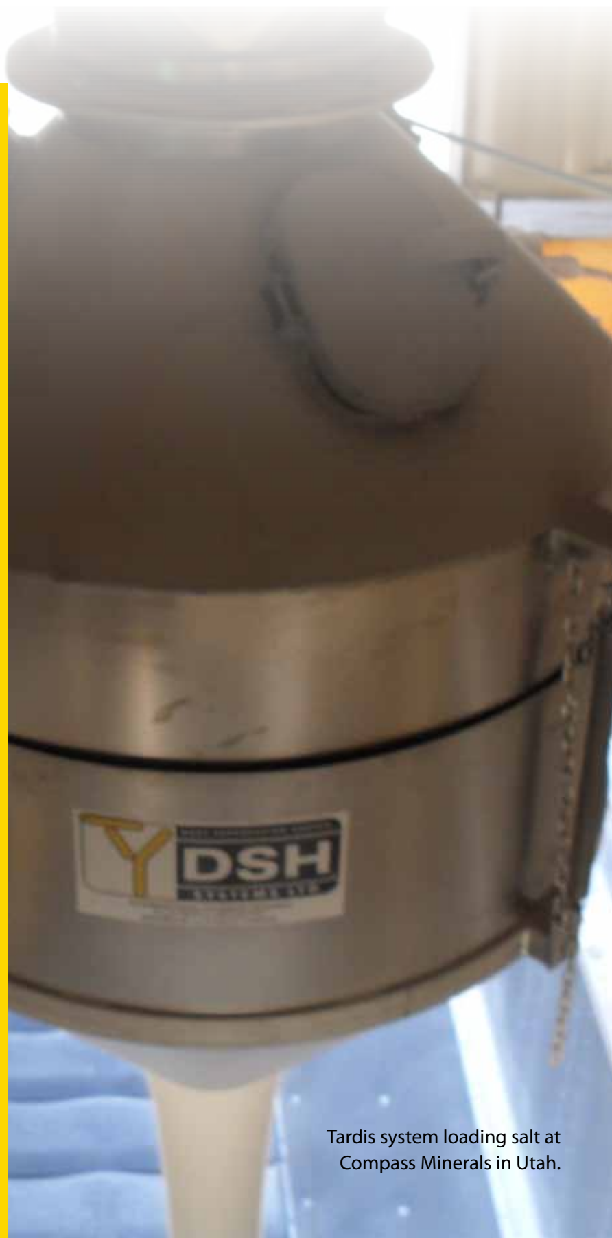
Tardis system loading salt at Compass Minerals in Utah.

If your site does not fit our standard products, we will endeavor to engineer a solution that works for your application.