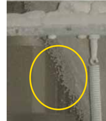
Dust generation by direct feed from conveyor belt. Particle break-away at the edge of the feed causes high volumes of dust.